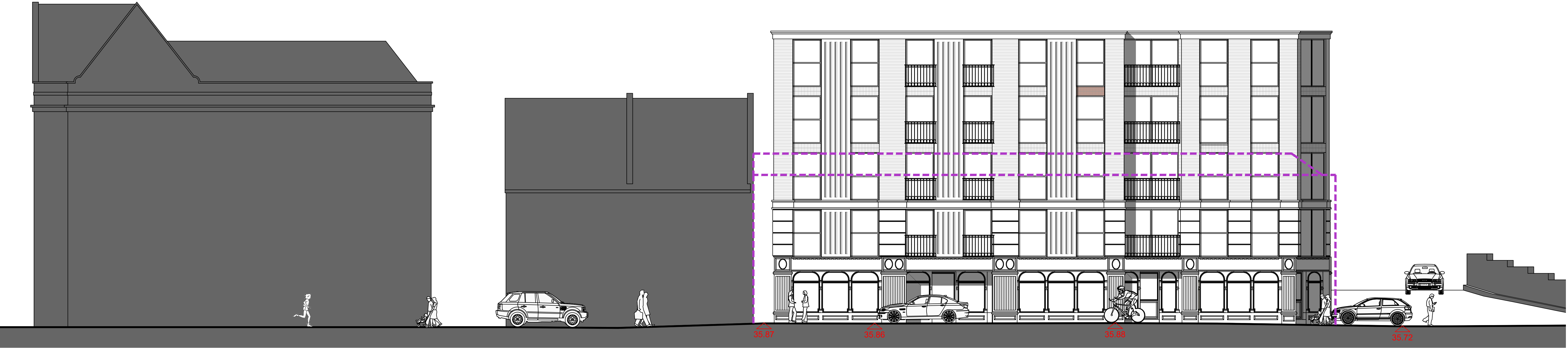
STREET SCENE: ASHLEY ROAD ( FOR INDICATIVE PURPOSES ONLY ) SCALE: 1:100